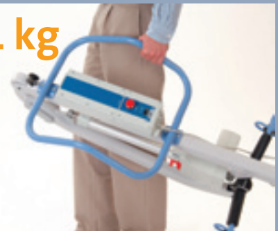
Mast and boom

In addition to outstanding performance, the Advance can also be folded, or separated for onward transportation.